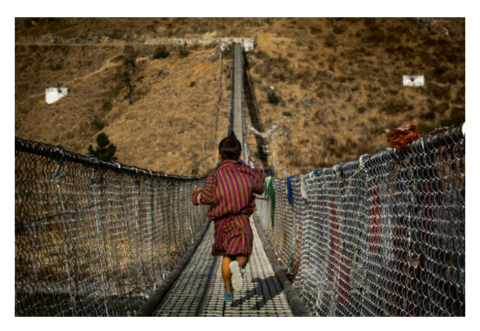
A boy run across the Punakha suspension bridge