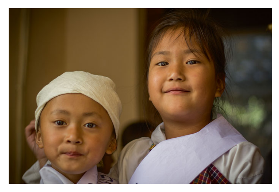
Students learn about other cultures in Bhutan during a lesson, such as the Lhops from Southern Bhutan

practice models have to offer and the best that repositories of local knowledge, experience, and the policy of GNH can bring" (Ball 2012, p. 6).