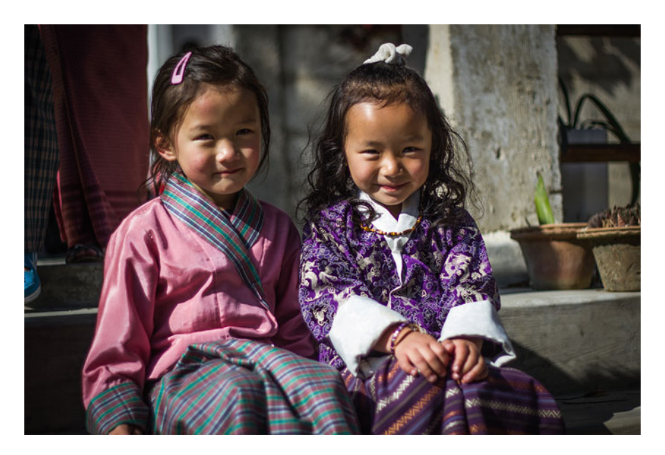
Pre-primary students are dressed up to celebrate children's day

The main message that we would like to convey is that inclusive education is not a foreign idea to Bhutan, nor something imposed from the outside. Rather, inclusivity is built into the very cultural fabric of the ideals to which Bhutan hopes to aspire. Gross National Happiness is most certainly an inclusive development philosophy; promoting well-being, health, education, community vitality, and diversity, among other domains. The current Bhutanese education system was not built around these ideas and current progress towards greater inclusion feels rather like trying to fit a square peg through a round hole. However, with critical reflection and hard work, an inclusive education agenda in Bhutan can bolster not just GNH for children with disabilities, but for the entire nation. As the Special Educational Needs Coordinator exclaims in the epigraph, "Now they know that these people can do."