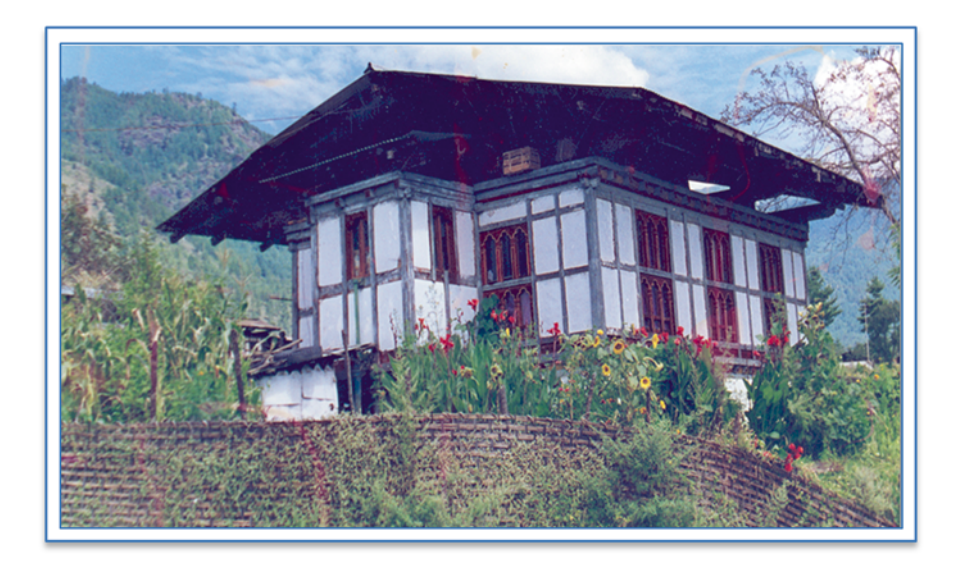
Fig. 1 g.so-ba-rig-pa medicine dispensary house established at Dechencholing in 1968

The Dechencholing g.so-ba-rig-pa medicine dispensary unit (DGMDU) first started providing three year on-the-job training, called the smen-pa course, in 1971. This smen-pa training course was the precursor to professional-based g.so-ba-rig-