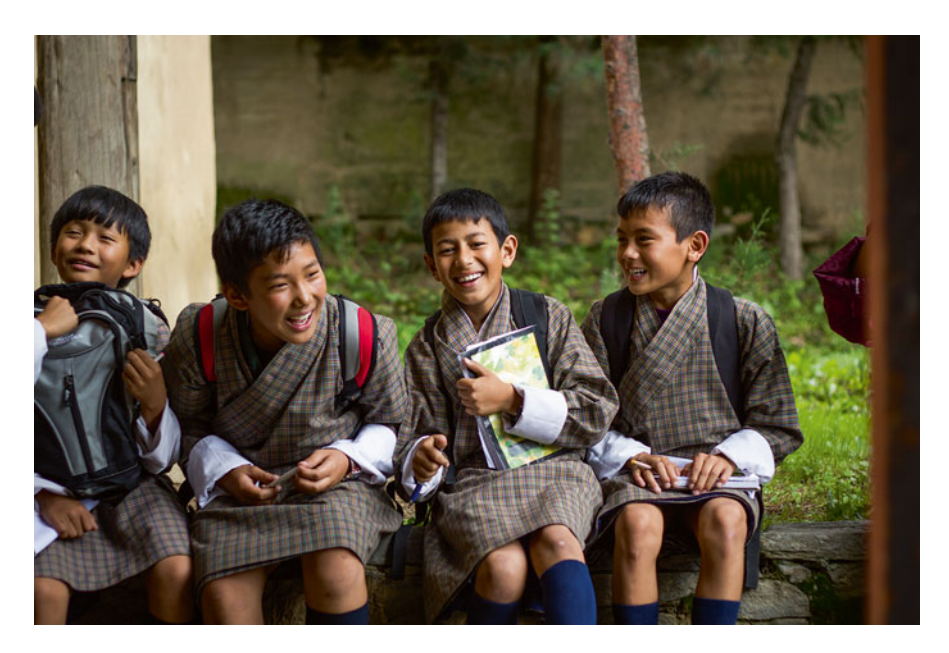
Students have fun on a school fieldtrip