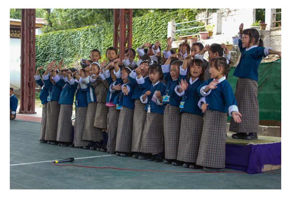
Students perform a song for their school's signing competition