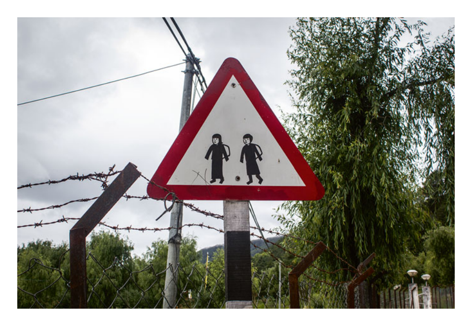
A local school crossing sign