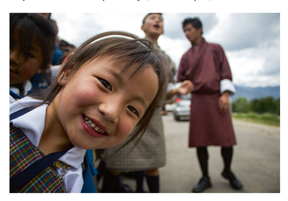
Students happily wait along the road to be blessed by the Je Khenpo