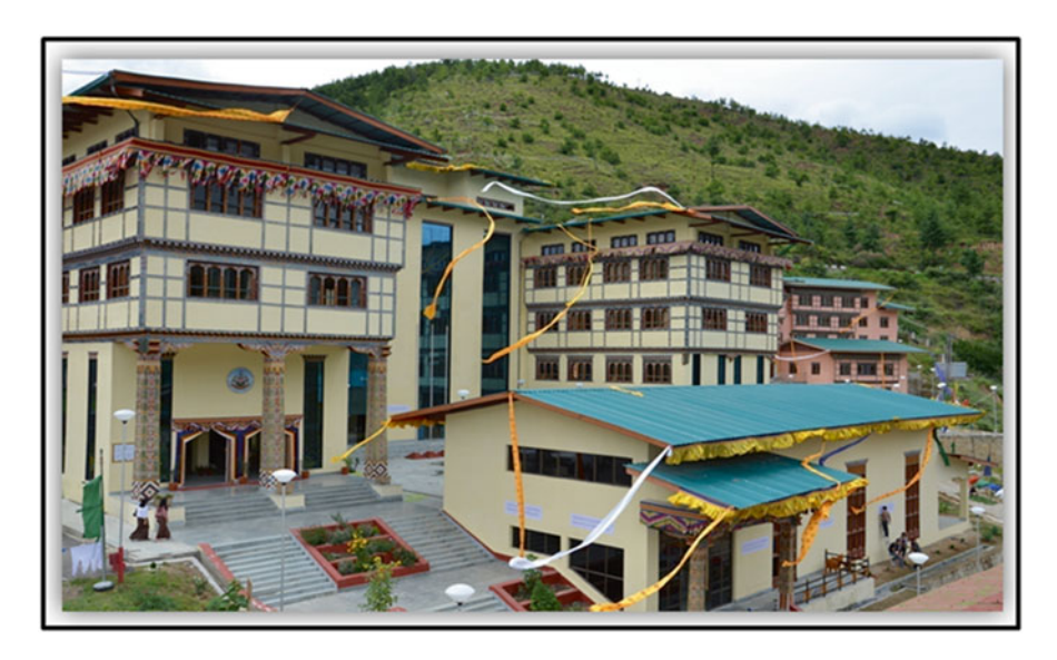
Fig. 3 New administrative and teaching building and student accommodation building built in 2013

(UMSB) in 2013 which was in 2015 renamed as the Khesar Gyalpo University of Medical Sciences of Bhutan (KGUMSB). The FoTM has a newly constructed state-of-the-art administrative and academic block (Fig. 3) with built-in library facilities providing more than 5,000 items on both g.so-ba-rig-pa medicine and others; a computer laboratory with Wi-Fi internet connections; modern lecture rooms equipped with liquid-crystal display projectors; a demonstration laboratory with facilities and dummies to learn human anatomy; and the traditional equipment for medicinal preparations.