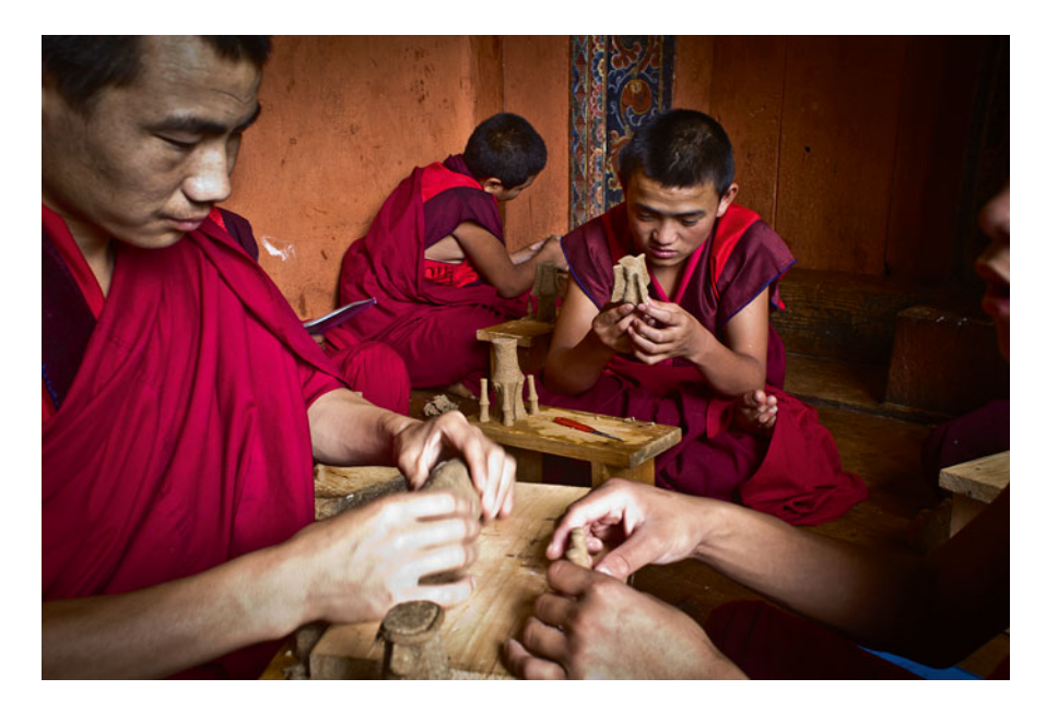
Young monk acolytes practice making torma

The Education Blueprint (MoE 2014) is focused only on secular education, and a majority of the Royal Government educational budget is put towards secular education. Section 20 of Article 9 of the Constitution of Bhutan (RGoB 2008) requires the State to promote "a compassionate society rooted in Buddhist ethos and universal human values." This can be achieved only through education, both modern and monastic. Surely there is a great opportunity now in the twenty-first century to come to the conclusion that education in Bhutan need not be a 'one or the other' proposition. In exploring the history of Buddhist education, we are reminded that formal education in Asia has had a proud tradition of culture, knowledge, and – indeed – innovation for thousands of years. The two systems of education – sacred and secular – both serve the culture, people, and development of Bhutan in separate but interwoven ways.