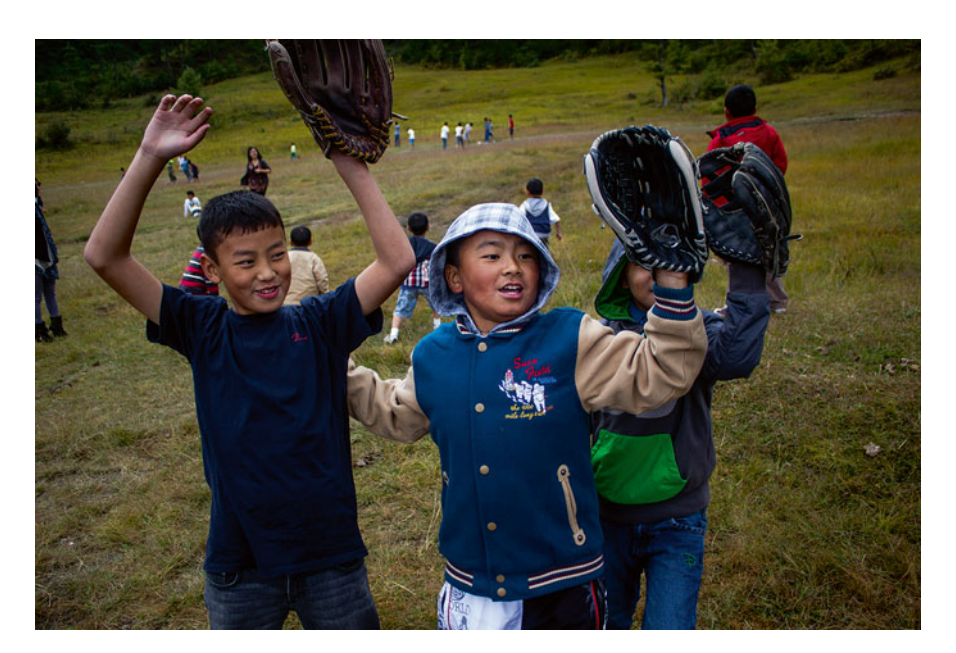
Students play baseball at a school picnic

Overall, upgrading the staff qualifications, adapting the curriculum, diversifying the courses, and building good research and development has an ultimate bearing in: (a) providing quality traditional medical education, (b) attracting merited domestic and international students, (c) opening up career opportunities for its graduates, (d) providing quality traditional medical services and medicines, (e) fostering better respect and collaborations, and (f) preserving Bhutan's rich traditional medical heritage. Strong foundations in research and development areas would eventually make the FoTM a major competitor in the global marketplace for traditional medicines and could promote the innovation of Bhutanese research. This can ensure the future sustainability of the FoTM and put the KGUMSB in a better position to become the prestigious traditional medicine research university in the Himalayan region.