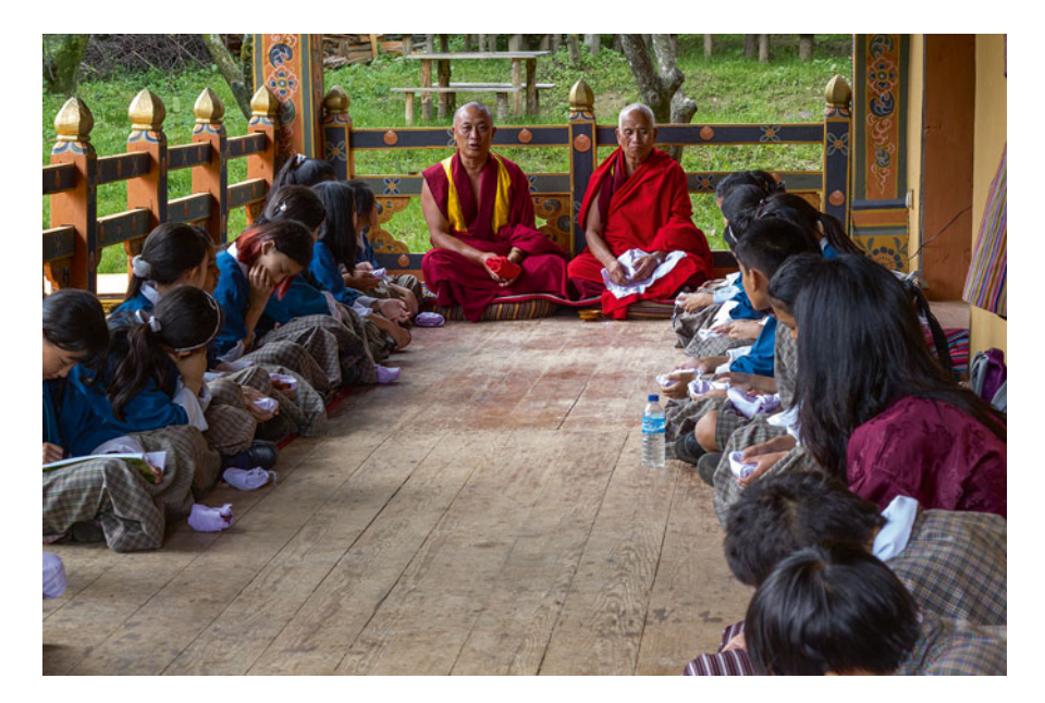
Students receive teachings from monks before sharing lunch together

Acknowledgments I would like to thank the numerous people who were engaged in the interviews and conversations. The data on which this paper relies were mostly collected during fieldwork on food security in rural areas, and I would like to acknowledge the warm understanding and hospitality from the Ministry of Agriculture. Fieldwork was partly funded by the following research grants from Japan Society for the Promotion of Science (JSPS): KAKENHI 23510313 and 20710191.