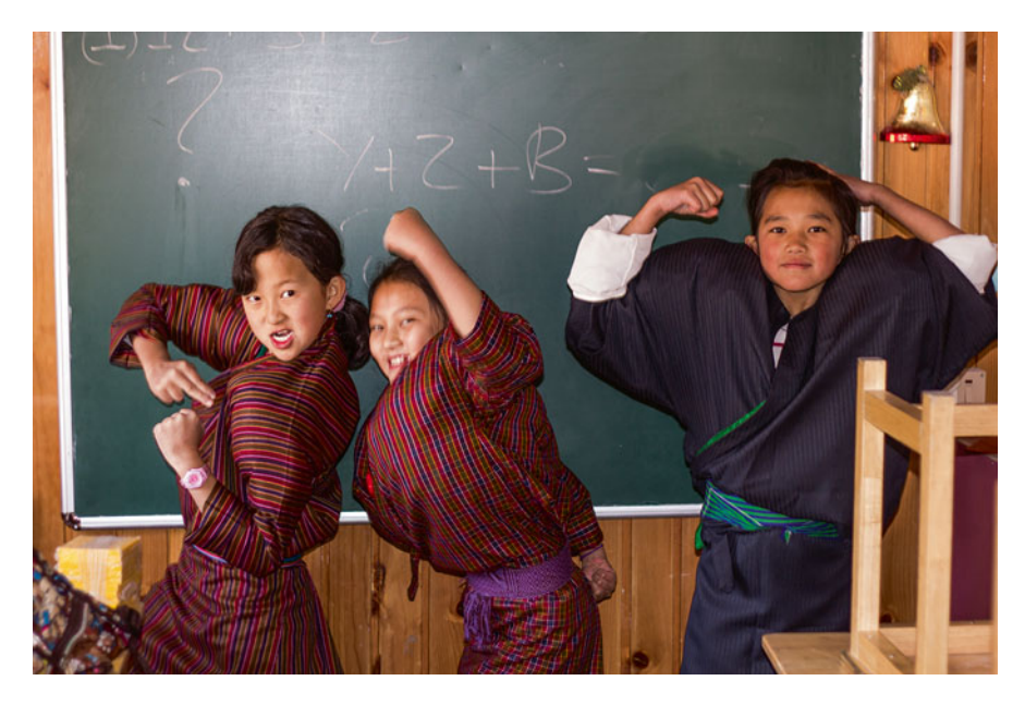
To celebrate Teacher's Day, students parody a bodybuilding competition for their classmates and teachers

In conclusion, educational progress has been seen as an important factor contributing to the attainment of the country's cherished goal of Gross National Happiness. The NFE programme has certainly contributed to this. Creating enabling conditions for all to benefit from the process of learning through formal, non-formal, as well as informal modes will go a long way in advancing towards that goal. The gains made by the NFE programme for disadvantaged citizens must be sustained and enhanced by efforts made to address the challenges. Employment creation opportunities through income generation activities beyond the social, cultural, civic, and sustainability education objectives should receive due attention. The realisation of the full potential of the NFE programme requires a close assessment of the achievements vis-a-vis its intent together with a thorough examination of gaps that have hindered progress. Visible empowerment of the disadvantaged communities through literacy and numeracy as well as life-skills education, popularisation of the national language, increased participation in local governance especially by women, enhanced understanding of health and hygiene issues, deeper appreciation of environment, and land management concerns has indeed improved the standard of living and been some of the deeply gratifying outcomes of the NFE Programme.