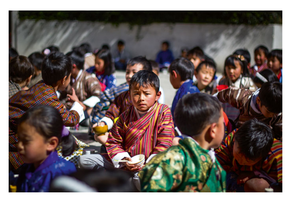
Students dress up in their best ghos and kiras to celebrate Children's Day

places the success of the EGNH initiative on the formation of a comprehensive framework that also focuses on larger economic, social, and political conditions related to educational quality and equity in the society. Therefore, the application of the CA provides the EGNH initiative a much needed focus to ensure that the EGNH initiative, as a national educational goal, creates the conditions necessary to provide every individual with the freedom to develop to the best of his or her capabilities, to enable every individual to live and choose the type of life they value, and to choose a life that leads to well-being and happiness.