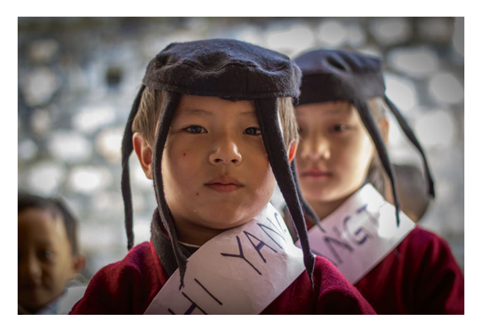
This student shows the traditional dress of the people from Trashiyangtse

If interventions to raise teacher self-efficacy for the EGNH initiative, with special focus on classroom practices, were not implemented, perhaps the consequences would likely doom the initiative. In the long run, Bhutan needs to have not only educated citizens but also citizens with human values, consistent with GNH, inculcated in them. Such an achievement would address the King's vision of GNH as "development guided by human values" (Wangchuck 2009b, p. 6).